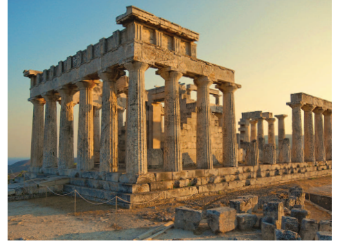
Above: The Temple of Aphaea, built circa 500 BCE, on the island of Aigina

Note: This program satisfies the field course requirement for Geology, Geography and Planning students to complete their BA/BS degrees. Detailed objectives are outlined in the course syllabus, available from the Program Directors.