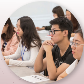
Daily Immersive Learning

The International Leadership in Action Program is designed for international university students who want to enhance their English language, professional communication, and leadership skills. This intensive two-week program offers a comprehensive understanding of professional English communication and leadership principles while fostering global awareness, cross-cultural competence, and practical leadership skills.