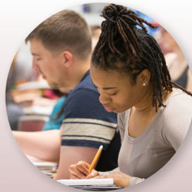
Leadership & Communication Workshops