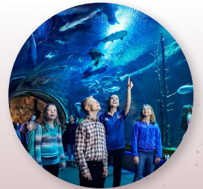
Cultural Adventures in Missouri