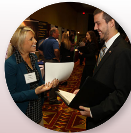
Networking with Community & Campus Leaders